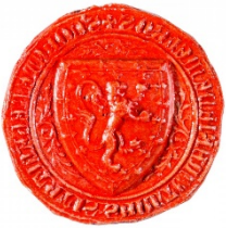
A wax seal found at Melrose Abbey.