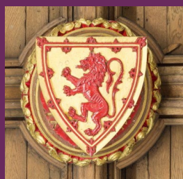
A stone lion on the ceiling of Edinburgh Castle's Great Hall.