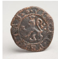
A James VI coin 1588 found at Tantallon Castle.